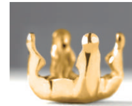
Beautiful frame in very light weight.