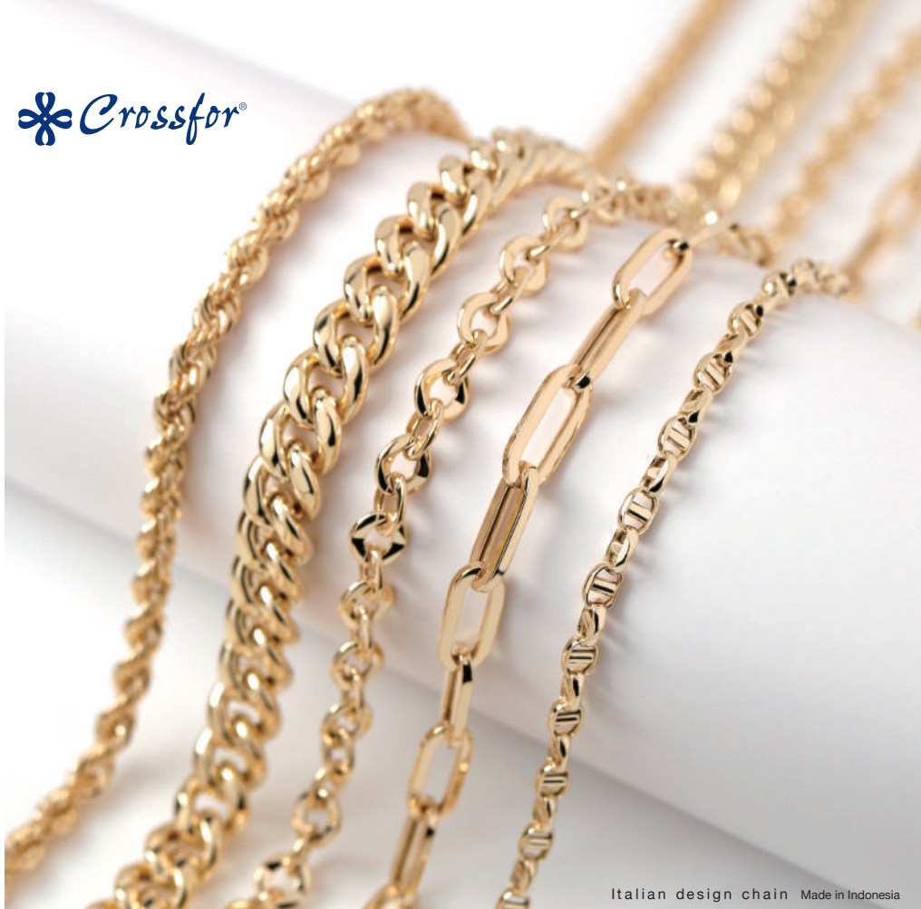
Italian design chain Made in Indonesia

Hollow chain with Italian design that combines volume and light wearing comfort.