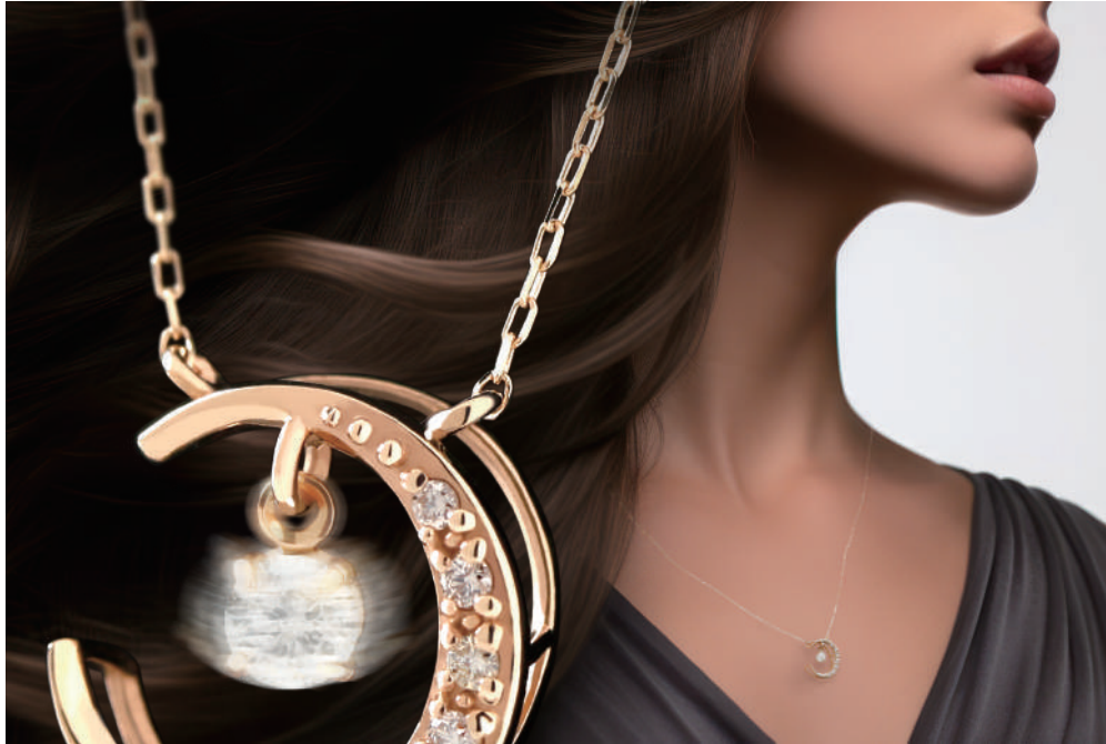
Enchanting Radiance Shimmering Stone is Crossfor's patent technology.

Another dancing stone with a simple structure that can be used for delicate designs, and with more complicated gemstone shaking.