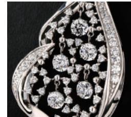
The simple structure of the dangling structure allows it to be adapted to variety of designs.