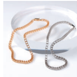
Design that achieves smooth and light movement through repeated trial and error.