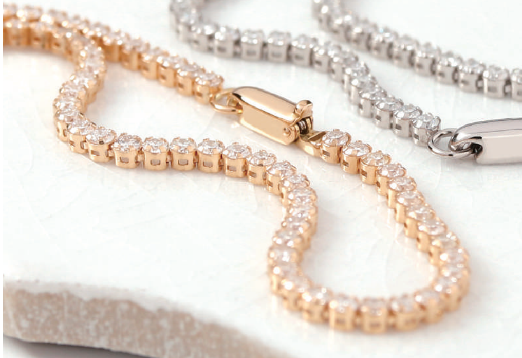
Crossfor original machine made tennis chain is light as feather and smooth as silk.

Crossfor's original tennis bracelet, with its silky light and smooth movement, makes gemstones shine beautifully.