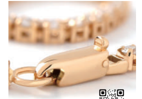
CROC LOCK™ How to use