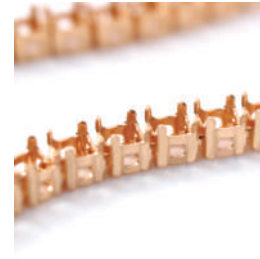
Original machine-made by Crossfor, which combines clean surfaces and lightness of bullion.