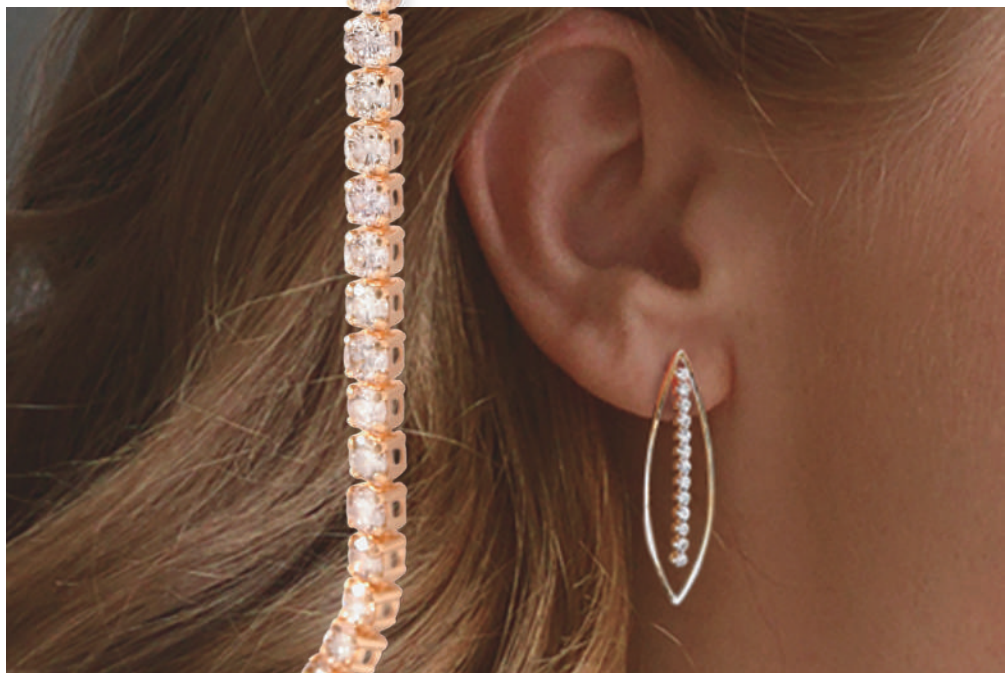
The brilliance born from supple and smooth movements