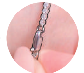
Step.3 / Close

[Available materials] 24K,18K,14K,10K,Pt and SV925