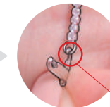
Step.2 / Hook