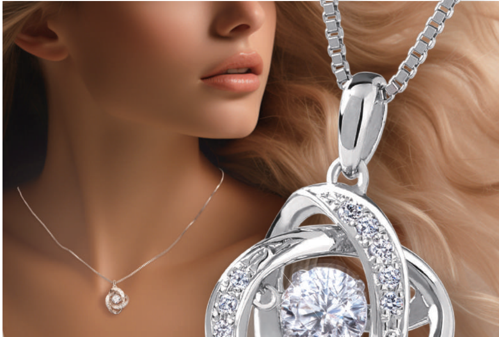
Dancing Stone is Crossfor's patent technology.

Dancing stone is a jewelry that shakes the gemstone to create maximum brilliance.