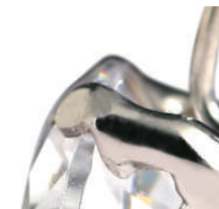
Wide spacing between prongs enables greater amount of light goes in and out for a better diamond shinning effect.