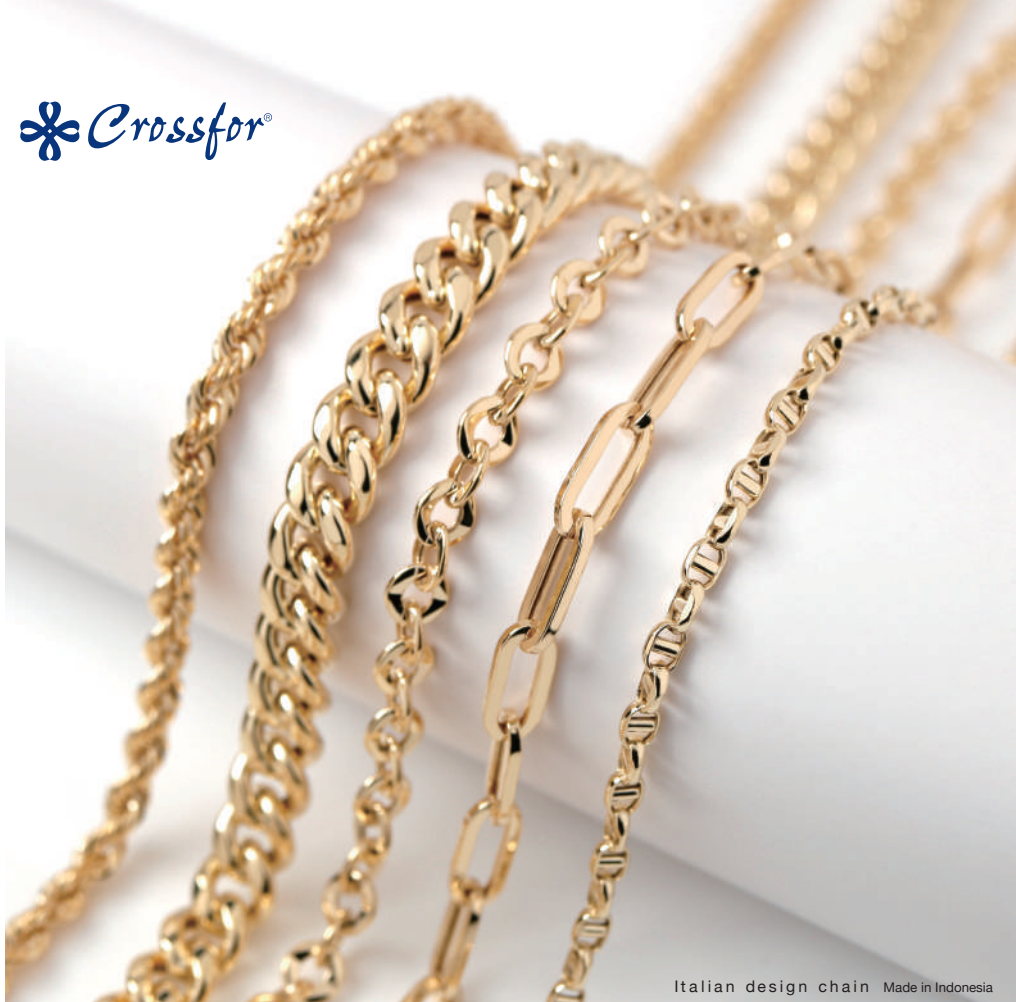
Italian design chain Made in Indonesia

Hollow chain with Italian design that combines volume and light wearing comfort.