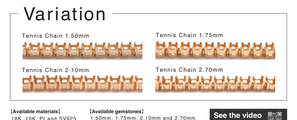
High quality and high flexibility due to complete in-house made-in-Japan manufacturing, ideal for OEMs.